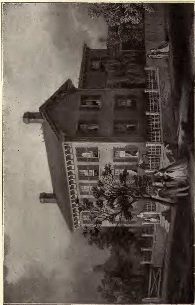
Home of Lincoln, Springfield, Ill.